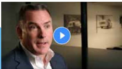
The CarNow Partnership

Proven executives with track record of partnering to create industry-leading solutions customized to your business